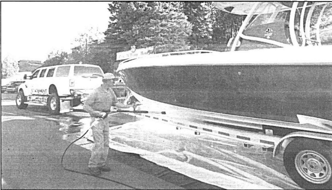
The Lake George Park Commission initiated a pilot project this past summer to test the effectiveness and efficiency of boat washing stations. The equipment was first demonstrated on Beach Road during the Lake George Performance Weekend.